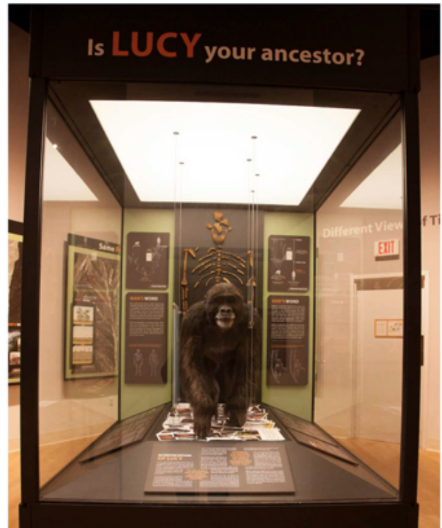
Figure 5: Lucy on all fours rather than bipedal on display at the Creation Museum underneath the phrase “Is Lucy Your Ancestor?” with the conventional fossil evidence looming in the background.

who uses Iraqi snack packaging and newspapers to recreate destroyed Mesopotamian antiquities like “ghosts to haunt us.” Rakowitz’s stand-ins fill the gaps left in the pockmarked landscape, and with his choice of cheap materials he ensures that these reconstructions, like their stone exemplars, will also fade and disappear. Greenland shares this lesson: The absence of materiality is also an opportunity for a powerful material encounter.