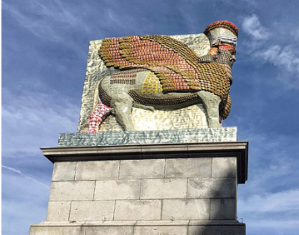
Figure 4: Reconstruction of a lamassu sculpture, based on an original destroyed by the Islamic State in Iraq and Syria. Papier-mâché, plaster and date syrup. London, Trafalgar Square.

when we think of materiality, we have tended to focus on the primal force of presence: of the look and feel of solidity in its heterogeneous composites and surfaces. She says it is the capacity of material things to do, to act, that transcends symbols and communication and delivers us into what Searle called the “brute physical facts” of the world. Yet she also indicates that for all its tactile facticity, materiality is fiendishly mutable.