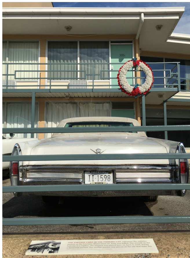
Note: National Civil Rights Museum, Memphis, TN (Site of Martin Luther King, Jr.'s Assassination).

at African American Museums where I use black museum patronage as a case to elaborate how the cultural values of the upper-middle and upper class diverge along such lines as race and ethnicity, profession, generation, and lifestyle. In the course of doing this research, I noticed that individuals weren’t the only important donor pool for black museums. Corporate gifts and sponsorships are also critical to their survival and sustenance. This insight put me on the path to studying black cultural patronage by corporations.