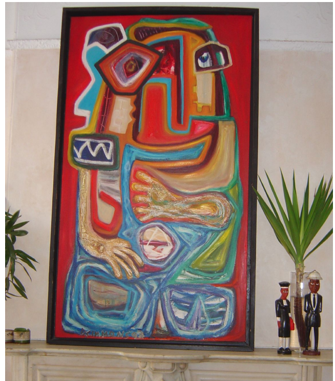
Note: Art in a Collector's Home.